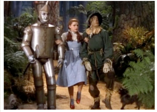
LIONS AND TIGERS AND BEARS? IN MONGOLIA? OH MY!

Matthew 10:16 and 7:15 are equally applicable to life here. Those who go out in Jesus' name, whether national or