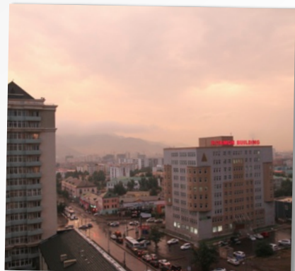
SAME CITY, NEW APARTMENT