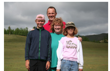
You can read more about our family experiences in Mongolia at: