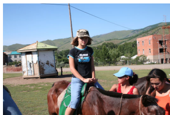
Horseback riding and mountain climbing at Terej