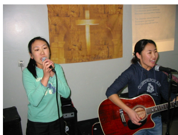
Student Church Leaders

A highlight of our 2003 Mongolia visit was the student church. It was a privilege to be among people rising above their difficult circumstances to worship God with exuberance and joy. Their faith was fresh and new and contagious.