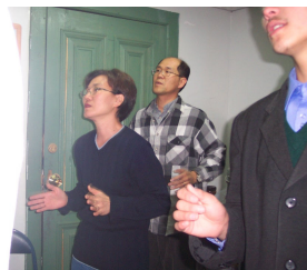
Worship with the Students