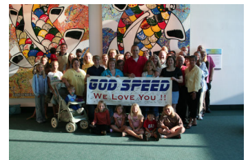
Tearful Farewells in Nashville

We arrived in UB during the wee hours of Wednesday morning. The air was cool, with a hint of rain. Our luggage (including the guitar!) made it off the airline on time and unharmed. A flat tire on the way to our new apartment made for the only minor incident. With the energetic help of our new team members, all luggage was hauled up five flights of stairs and by 4:00 Am, we were finally able to lay our heads down to sleep. We thank God for his provision. Our apartment is in the center of the city. We can see the mountains surrounding UB from our balcony. We thank all of you for walking this 'Road to UB' with us. Thanks for your continued partnership with us!